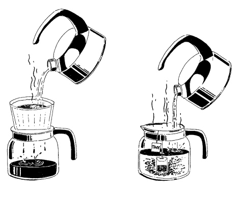
making coffee making tea

The way in which they could prepare the coffee and tea is shown below: